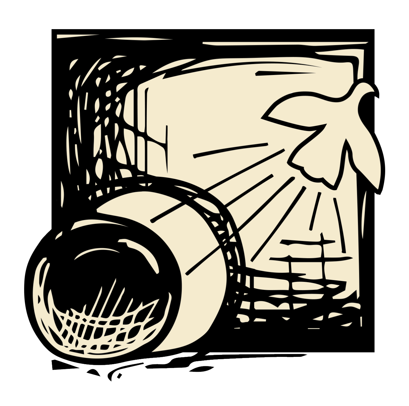
Fifth Sunday in Lent